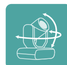
Wide Angle PTZ