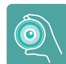
Handheld Camera Head