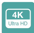
4K Output Resolution