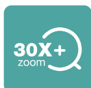
30X Optical Zoom